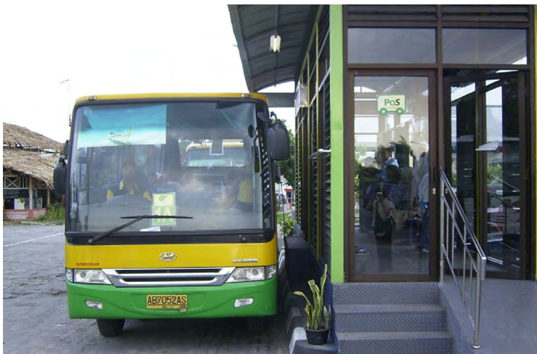
Yogyakarta, Indonesia; Photocredit: Manfred Breithaupt/2008