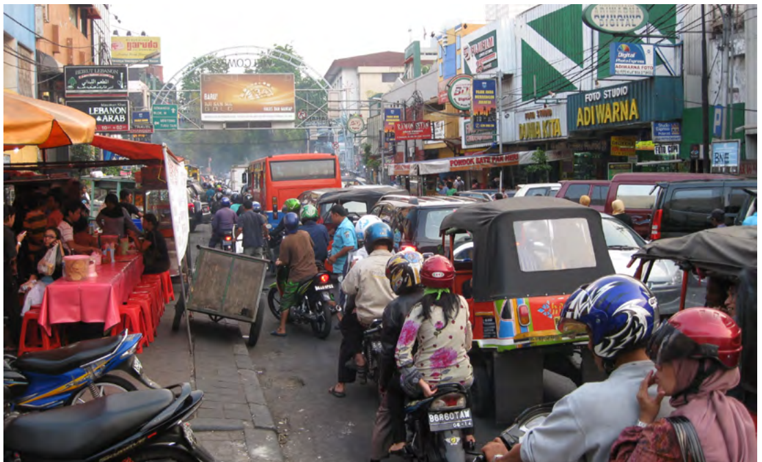
Indonesia, Photocredit: Ko Sakamoto/2013